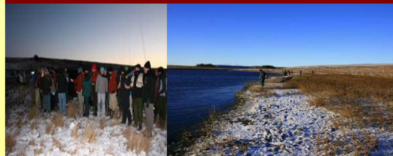
The Final, Day One, Session One, bracing themselves for the day ahead

The final last year proved particularly memorable with competitors fishing in sub zero conditions in the snow. It made little difference to the fishing though, as a record 731 fish were caught between 68 anglers over the four sessions.